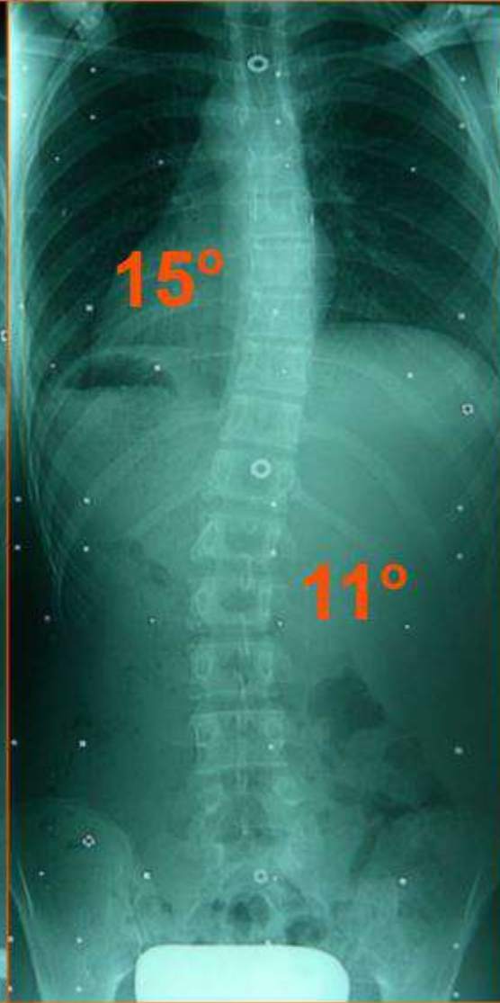
24 months in brace WOB x-ray