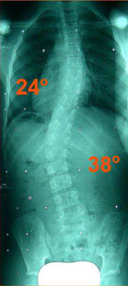
Initial WOB x-ray