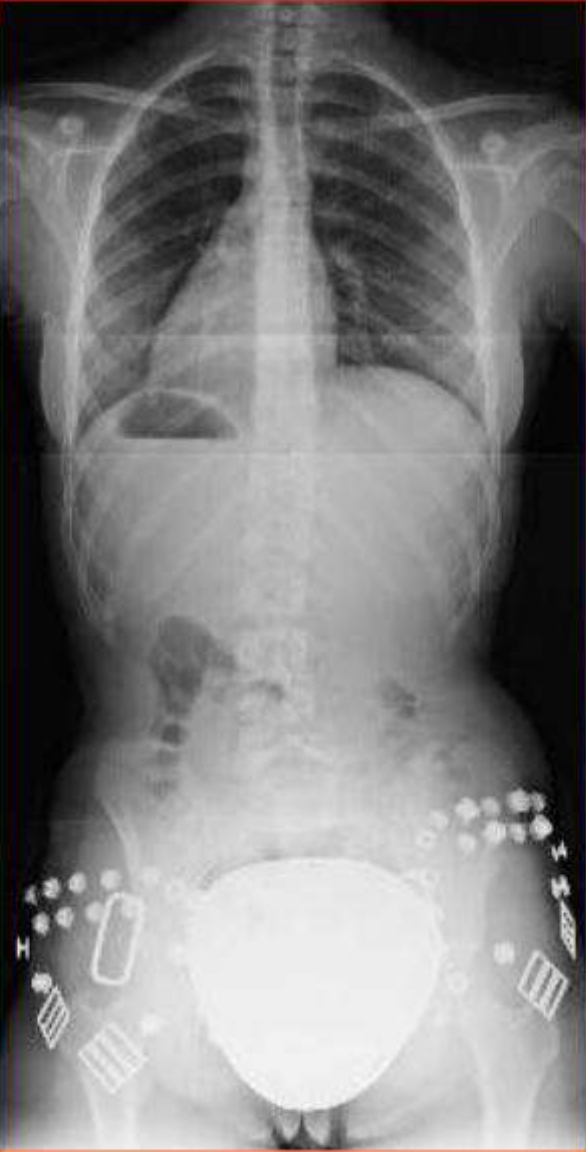
1 month in brace + shoe lift