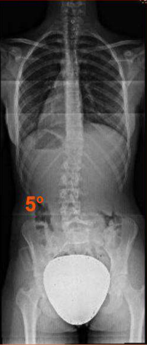
End of treatment WOB X-ray