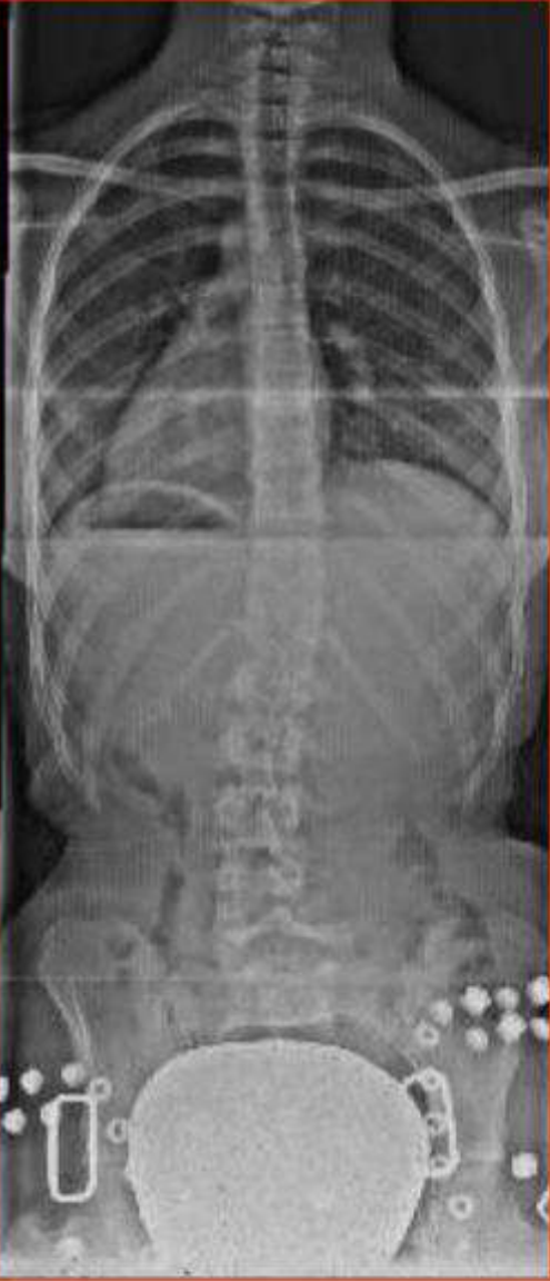
10 months in brace + shoe lift