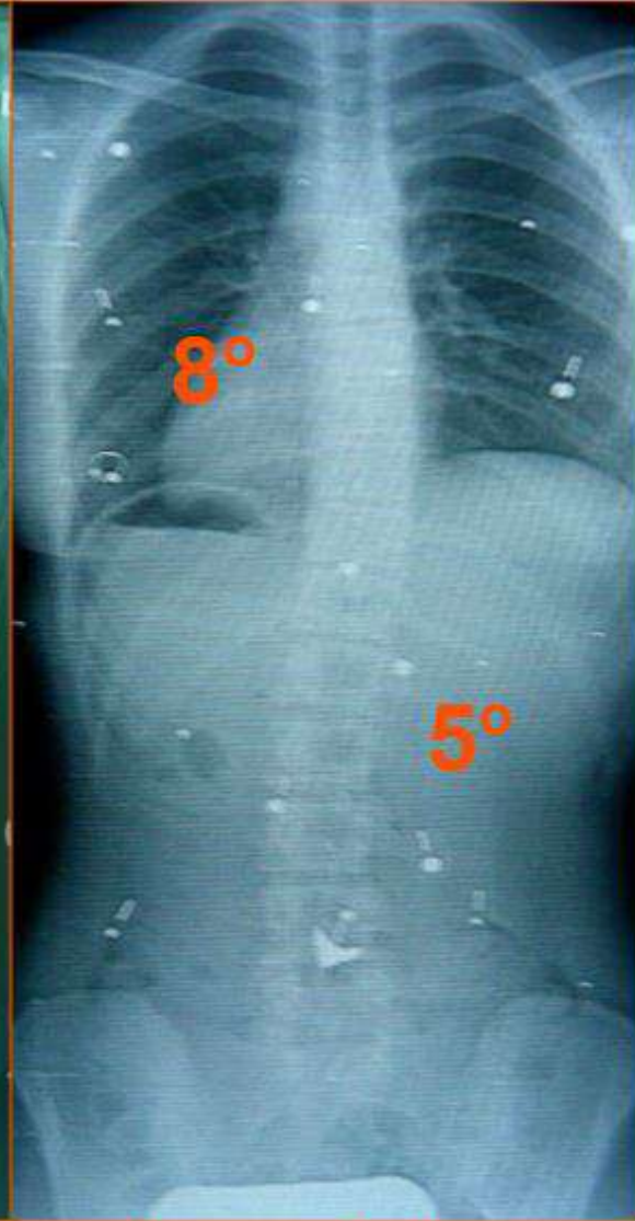
5 years after brace weaning