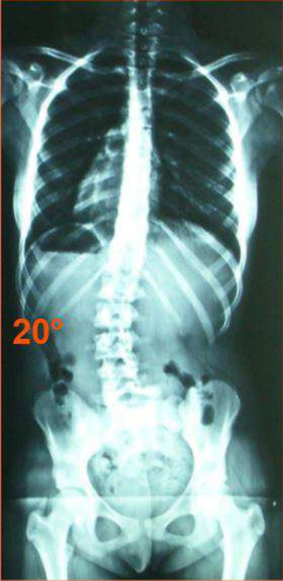
Initial WOB X-ray